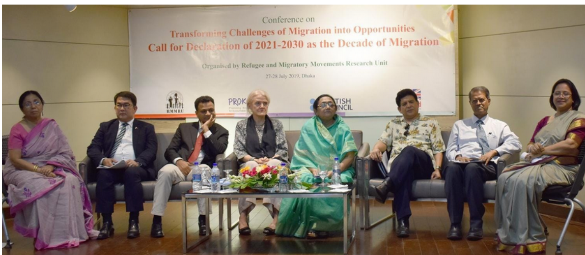
Photo: Transforming Challenges of Migration conference, Concluding Session speakers; Piyasiri Wickramasekara 2 nd from right. Dhaka, 27 July 2019.

8. Piyasiri Wickramasekara spoke at the Conference ' Transforming Challenges of Migration into Opportunity: Call for Declaration of 2021-2030 as the Decade of Migration in Bangladesh ', in Dhaka, 27-28 July 2019, organised by Refugee and Migratory Movements Research Unit (RMMRU).